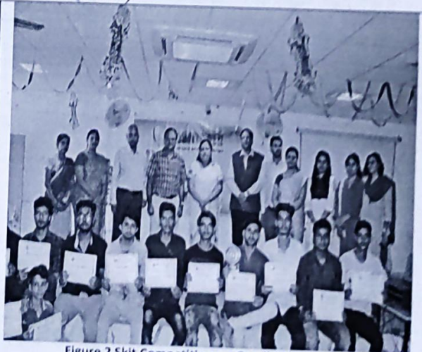
Figure 2 Skit Competition on Gandhiji Ka Bharat, 2/10/2019