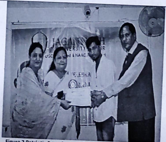
Figure 2 Patriotic Song Competition on Gandhi Jyanti, 2/10/2019