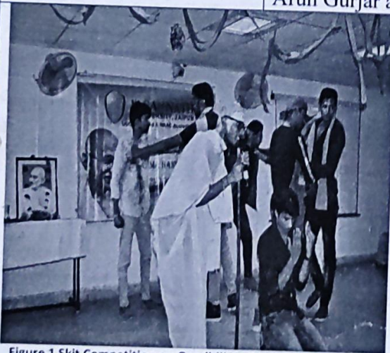
Figure 1 Skit Competition on Gandhiji Ka Bharat, 2/10/2019